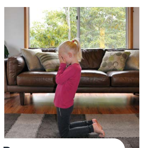
Drop gently to your knees, then lie down on the part of your clothes that are on fire.