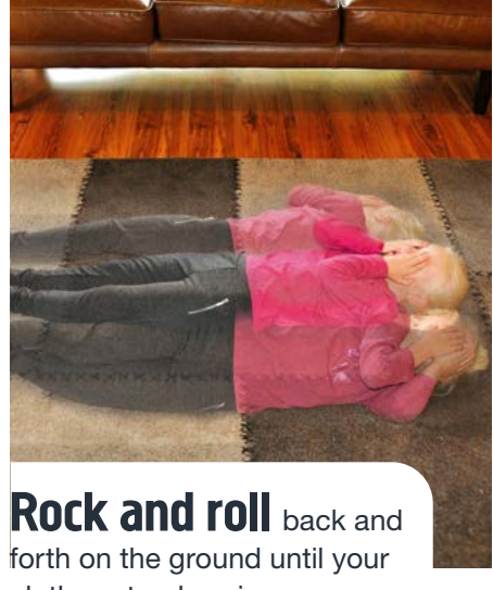
clothes stop burning.

This will smother the flames while protecting your face, mouth and lungs from the flames.